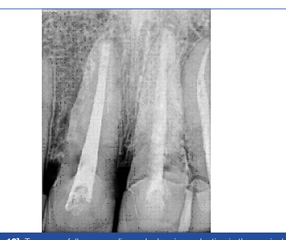
[Table/Fig-12]: Two years follow-up radiograph showing reduction in the cervical radiolucency and radiopacity within the defect suggestive of bone-like tissue filling the defect.

The patient was re-evaluated on a regular basis. The patient was recalled for radiographic evaluation after two years and reduction of cervical radiolucency (improved radiopacity compared with previous radiographs due to bone or bone-like tissue in-filling the defect) indicated reparative procedure of apical bone regeneration [Table/Fig-12]. No signs were detectable of this radio-opaque tissue progressing into ankylosis of the tooth. The teeth were asymptomatic with no periodontal pockets circumferentially.