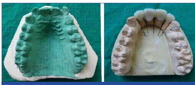
[Table/Fig-10]: Casts comparing the change in occlusion.