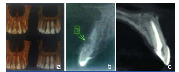
[Table/Fig-2]: Preoperative cone beam computed tomographic analysis slices: a) CBCT slice showing the location and extent of invasive cervical resorption irt 21; b) Sagittal CBCT slice showing outer inflammatory resorption(green arrow); c) Preoperative Cone Beam Computed Tomographic (CBCT) analysis slice irt 11 showing a well-obturated canal.

The axial slices revealed the entry points of the granulomatous tissue to be located in the disto-palatal region at the bone crest. It showed irregular canal morphology with scattered radiopacity indicative of Invasive Cervical Resorption (ICR). There was no communication with the root canal. A small invasive resorptive lesion was evident close to the cervical area with shallow dentinal penetration, which helped to establish the clinical classification of ICR Class I (Heithersay's GS classification) [1]. Although, there was no frank communication with the root canal of the tooth, the invasive resorptive process was encroaching upon cervical and middle third of the root. The clinical findings and CBCT analysis were not suggestive of any resorptive defect in respect to 11 [Table/Fig-2].